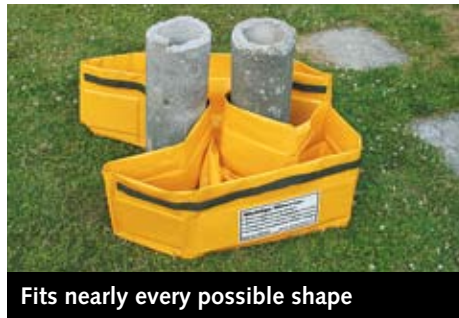
Fits nearly every possible shape

The OTTER basins are part of a patented system from Acquaalta Schutzsysteme GmbH in Switzerland. The various basins are installed in a few seconds and, thanks to their unique suppleness, they are the only basins on the market today being able to adapt to the ground's asperities as well as to obstacles located in the zone of operation and even adapt in height. The basins are made of very rugged tarpaulin, consisting of a polyester mesh with a high frequency welded PVC-coating on both sides.