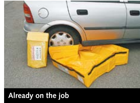
Already on the job