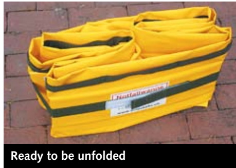
Ready to be unfolded